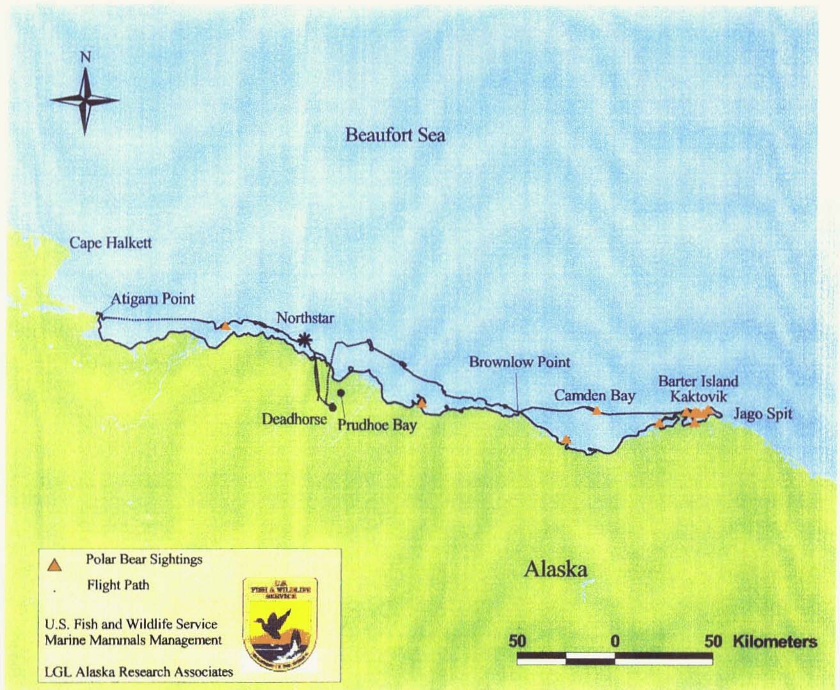
Figure 3. Polar bears observed during an aerial survey conducted along the coast and barrier islands of the Beaufort Sea, Alaska, September 26, 2001.