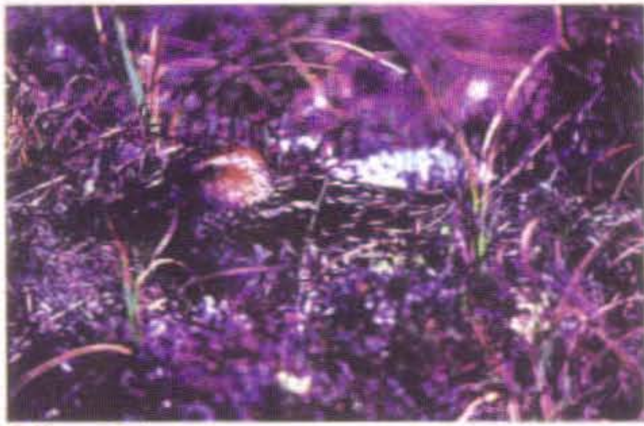
Stilt sandpiper on nest.