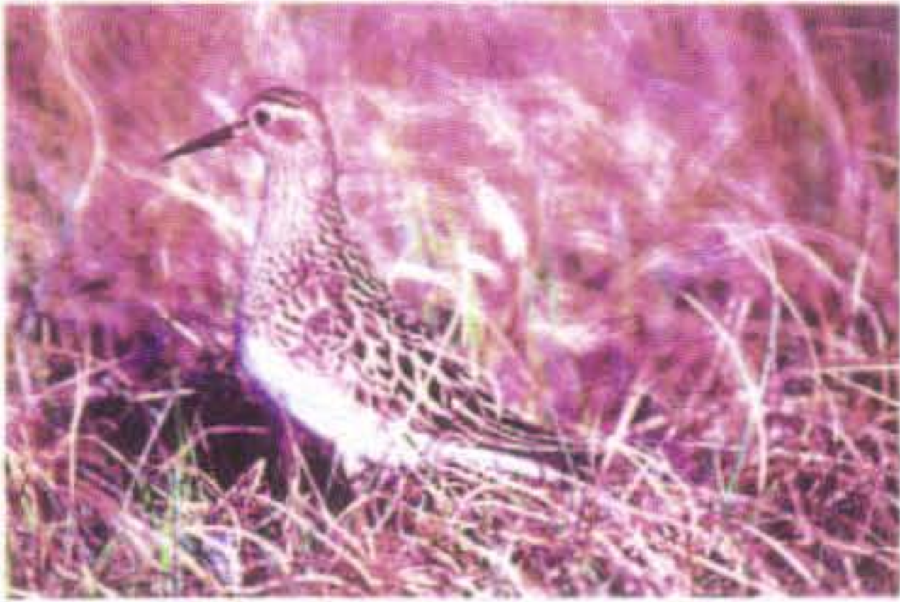
Male pectoral sandpiper.