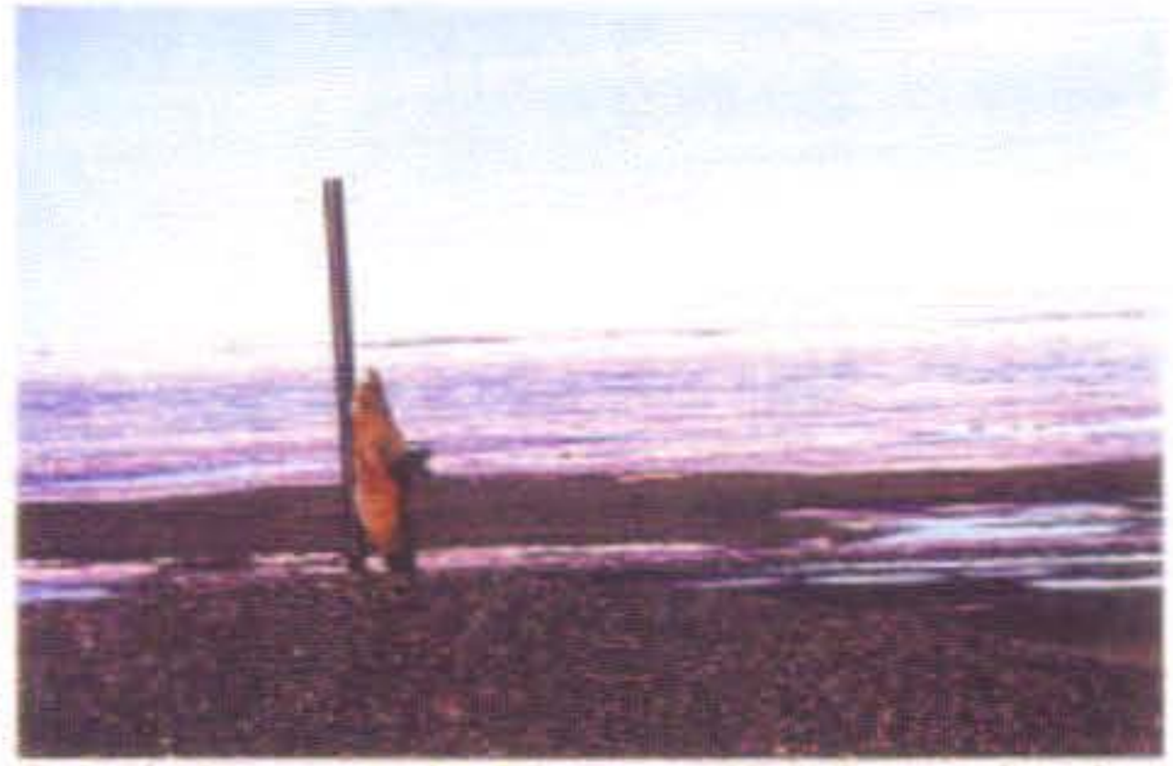
Grizzly bear at Point Thomson Unit 3 gravel pad.