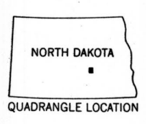
WATER-TABLE CONTOUR MAP, BASED ON POTHOLE WATER SURFACES, SHOWING LACK OF CONFORMITY WITH GROUND-WATER LEVELS IN MOST DEEP WELLS AND CONFORMITY WITH WATER LEVELS IN SHALLOW WELLS, GOLDWIN SE QUADRANGLE, NORTH DAKOTA