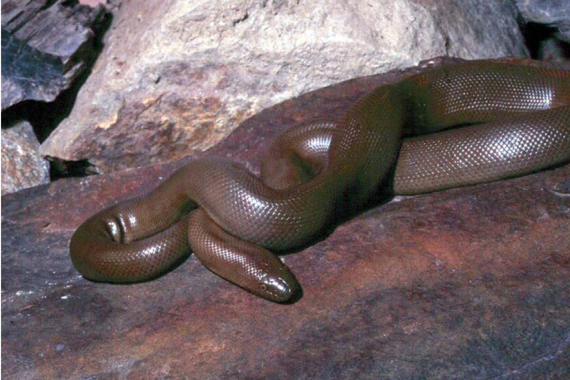
Figure 1. Rubber boa ( Charina bottae ).

Rubber boas probably grow slowly. The females are relatively large when they first reproduce; therefore, they have a long period of sexual immaturity. In addition, they probably reproduce only once every two to four years and give birth to only two to six large young (St. Clair 1999; Hoyer and Stewart 2000). These life history traits are characteristic of plants and animals that have high survival rates both as adults and young. Populations are, therefore, vulnerable to increased mortality at any life stage.